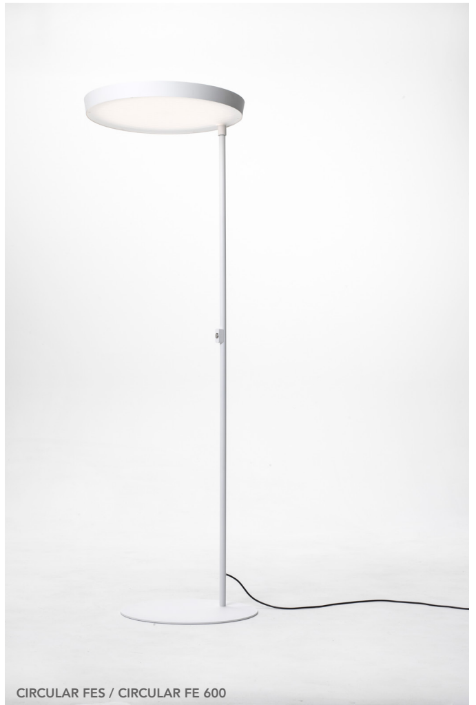
CIRCULAR FES / CIRCULAR FE 600