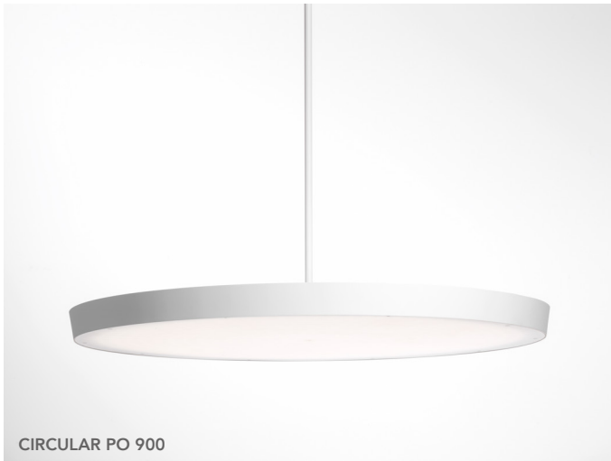
CIRCULAR PO 900